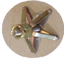
Five Way Expansion

An all metal cavity, expanding cavity fixing suitable for use in plasterboard and any other cavity application. With 5 expanding legs the Hollow Wall Anchor provides the maximum bearing area to withstand lateral and shear loads