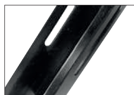
PROCESS THREE ED coating process: electrophoretic deposition (aka ED or EPD) coating