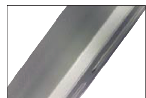
PROCESS FOUR Epoxy polyester powder coating