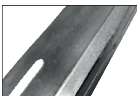
PROCESS ONE Corrosion resistant raw material, often referred to as Zintec